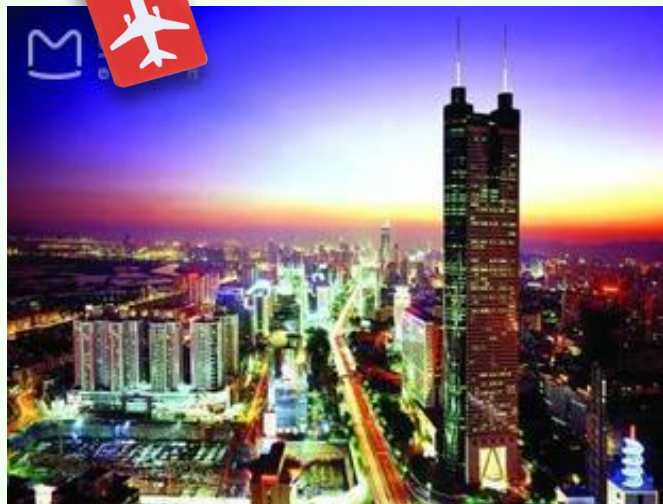
地王观光 (MERIDIAN VIEW)